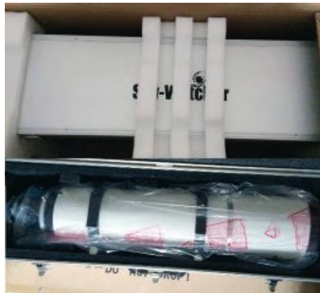
Image 3 - The Esprit 150 ships enclosed in a silver hard-side carrying case with handles, which is, in turn, enclosed in a well-padded shipping box.