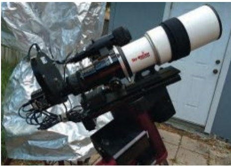
Image 17 - Sky-Watcher's Esprit 80 atop a Software Bisque MYT.

CCD camera my Starlight Xpress Trius 694 mono camera with a full complement of Baader LRGB and narrow-band filter – a smaller chip, but more sensitive and incredibly low noise, it should do well at f/7, and the small pixels should really put to test this scope's resolving power. Over the course of the week, I gathered just over 15 hours of RGB+OIII data on Thor's Helmet ( Image 12 ), and I could not have been much happier.