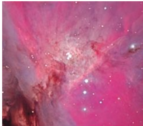
Image 11 - This crop of M42's Trapezium region distinctly reveals each of the four famed stars.

height. This must be why Sky-Watcher provides their own adapters with the scope, at least for the Canon cameras. The adapters are very wide and open and provide an unobstructed light path all the way down to the chip on the camera. All optical systems will have some vignetting. This is what some looks like, and I had to stretch it hard with some contorted curves to find it. Remember too, this is a Canon 5D Mark III here, a comparatively large chip. The APS-C-sized chips in a 60Da or most modified Rebel DSLRs truly will be vignetting free.