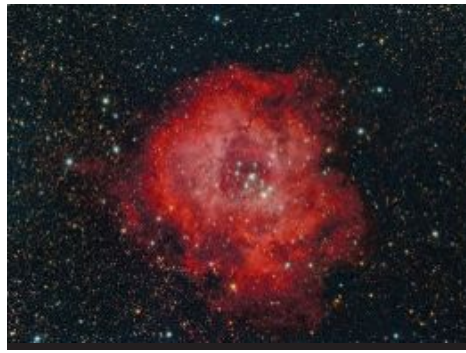
Image 20 - The Rosette Nebula shot through an Esprit 80 with a QHY10 one-shot color CCD camera.

How did it do? Quite well! My LOMO triplet produced a huge rainbow, probably from the flattener as I've since determined, emanating from Rigel, and even my beloved Veloce cannot shoot the Witch Head without some interference from Rigel. But the Esprit 80 delivered beautifully. F/5 is twice as fast as f/7, and jockeying for the astrophotography contest, I only allowed two hours per target. But two hours were all I needed for some nice