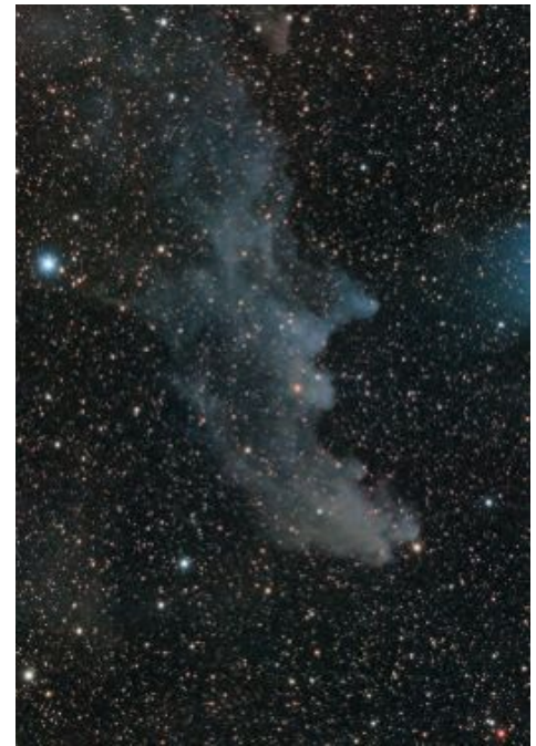
Image 19 - The Witch Head Nebula captured at the Winter Star Party with a Sky-Watcher Esprit 80 and QHY10.

I asked Sky-Watcher USA if they could possibly send me one in time for the Winter Star Party with the intention of shooting the Witch Head Nebula. I've attempted her in my 600-mm scopes with large imaging chips, but she's a hard object to get, and every year she has defeated me. Rigel is always producing some glare off to the side, or some bug-a-boo UFO