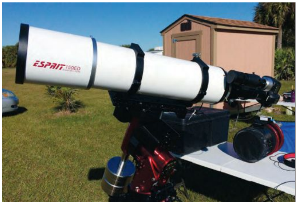
Image 1 - Sky-Watcher's Esprit 150 set up for a night of imaging.

My first quality instrument in this class was a classic Takahashi FC-76 I purchased from the son of a deceased amateur at a swap meet at the old Mid Atlantic Star Party. Like the first time I looked through a quality eyepiece (well before the imaging bug took hold), this changed my perspective on what a quality refractor was. I went through several models, attempting to purchase something “affordable”