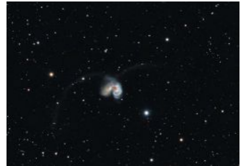
Image 13 - The Antenna Galaxies shot in LRGB with the Esprit 150 and a Starlight Xpress Trius 694.

grees at sunset, and as the temperature dropped, the focus on the scope shifted.