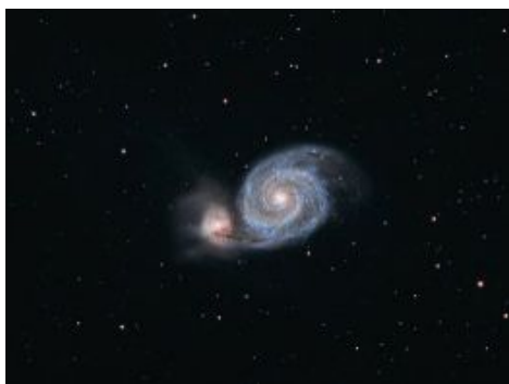
Image 14 - M51 captured with the Esprit 150 and Starlight Xpress Trius 694 under the strong luminance of a quarter Moon.

tic. Of course, the seeing was also quite good that night. I love Florida Winter imaging! Look at the unscaled crop from the center (Image 8). The stars are exceptional, especially considering I had to focus by hand.