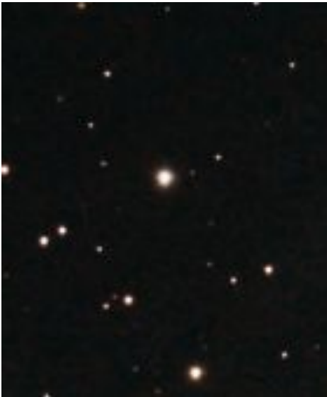
Image 9 - Even this crop from a far corner of Image 7 shows perfectly round stars.

other cameras. First, I have an unmodified Canon 5D Mark III. This is the big chip for DSLR imaging, and I had been told that there was almost no vignetting with this scope, even with a full-frame chip. Well, we'll see about that, I thought.