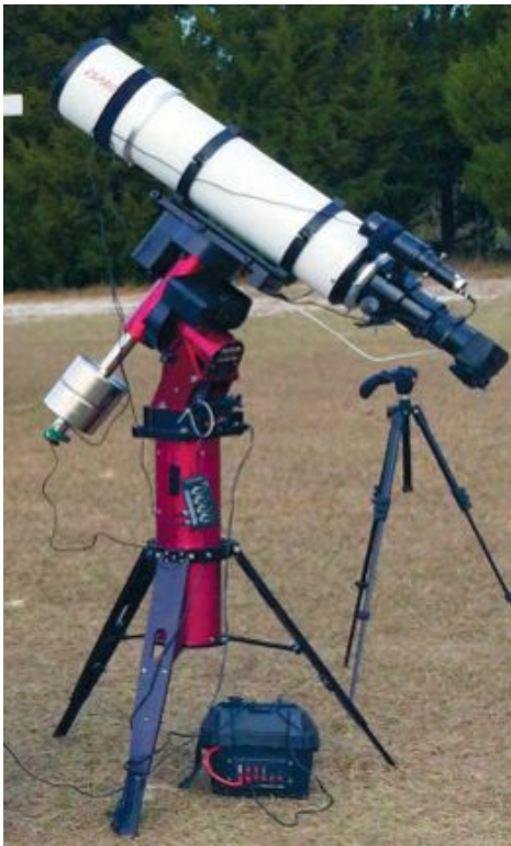
Image 2 - The reviewed Esprit 150 ready for first light at the Chiefland Fall Star Party.