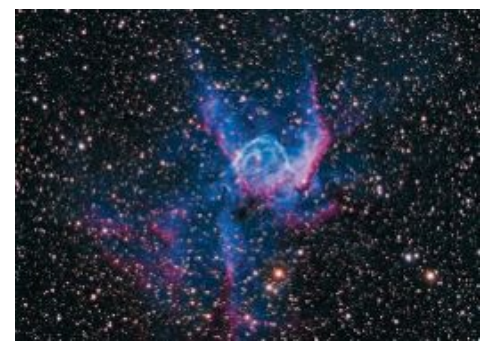
Image 12 - Thor's Helmet – 15 hours of RGB and OIII data captured with the Esprit 150 and a Starlight Xpress Trius 694 through Baader LRGB and narrow-band filters.

Of course, I needed a target that would do an unmodified DSLR justice, and that target was the Pleiades ( Image 7 ). The results were as I had hoped – outstanding! – with one caveat. Contrary to what many may think, it does sometimes get cold in Florida in the winter-time. The temperature dropped some 25 de-