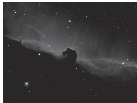
Image 16 - The Horsehead Nebula captured in Ha with the Esprit 150 and Starlight Xpress Trius.

Image 10 reveals the beauty of a true Apo: