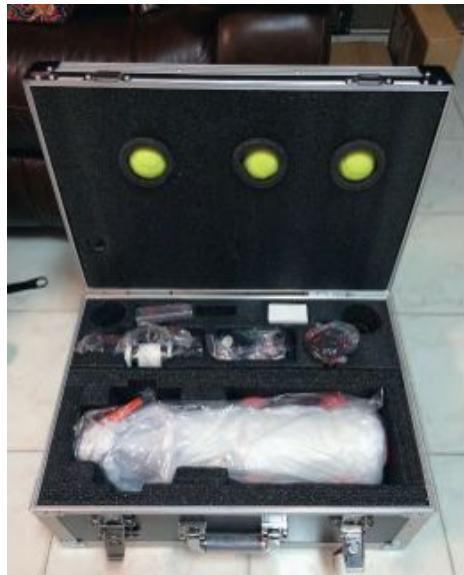
Image 18 - The Esprit 80 in its included carry case. Note the tennis balls cleverly positioned to serve as support points.

The Esprit 150 is the largest refractor in the Esprit line, and based on my experiences