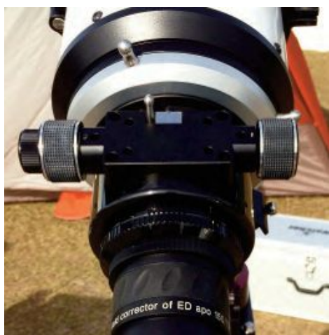
Image 5 - Closeup of the Esprit 150 focuser locking lever.