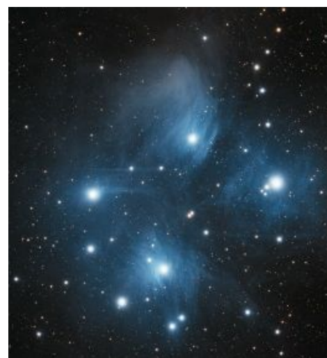
Image 7 - The Pleiades – 15 five-minute subs at ISO 800 captured with an unmodified Canon 5D Mark III via the Esprit 150.

A lever on the bottom (Image 5) applies force to the gear system, not pressing against the tube, for a shift-free locking mechanism. I did experience some shift laterally, but only an arc second or two – the shift was not back and forth. Sky-Watcher USA has since told me they have a new-and-improved focuser that eliminates even this small shift. Point is, I did not lose focus when I clamped it down, a welcome