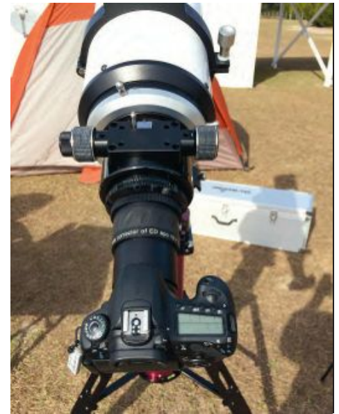
Image 4 - The Esprit 150's beefy focuser features a 1:10 fine-focus knob and an extra rail to prevent flexure under heavy loads. Shown also is the included field corrector securing a Canon 60Da.

My first night out was at the Chiefland Fall Star Party. New equipment . . . you know