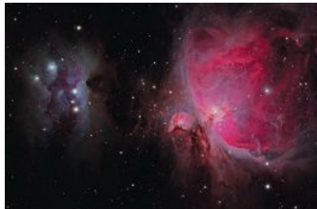
Image 10 - This image of the Orion-Running Man region was captured with a QHY10 one-shot color CCD via the Esprit 150. It is comprised of 16 five-minute subs for a total of an hour and a half of excellent data.

I'd seen this darker band before on my Velloce. It's from the camera itself, but the f/3 light cone on that scope brings that bottom obstruction up to about one-fourth of the image