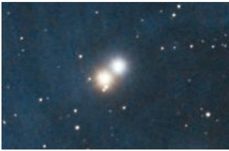
Image 8 - This unscaled crop from the center of Image 7 reveals exceptional stars, especially considering that the author focused the scope by hand.